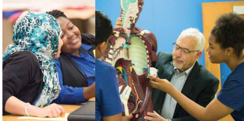
Patient Care Associate (PCA) Health Care Medical Career Program