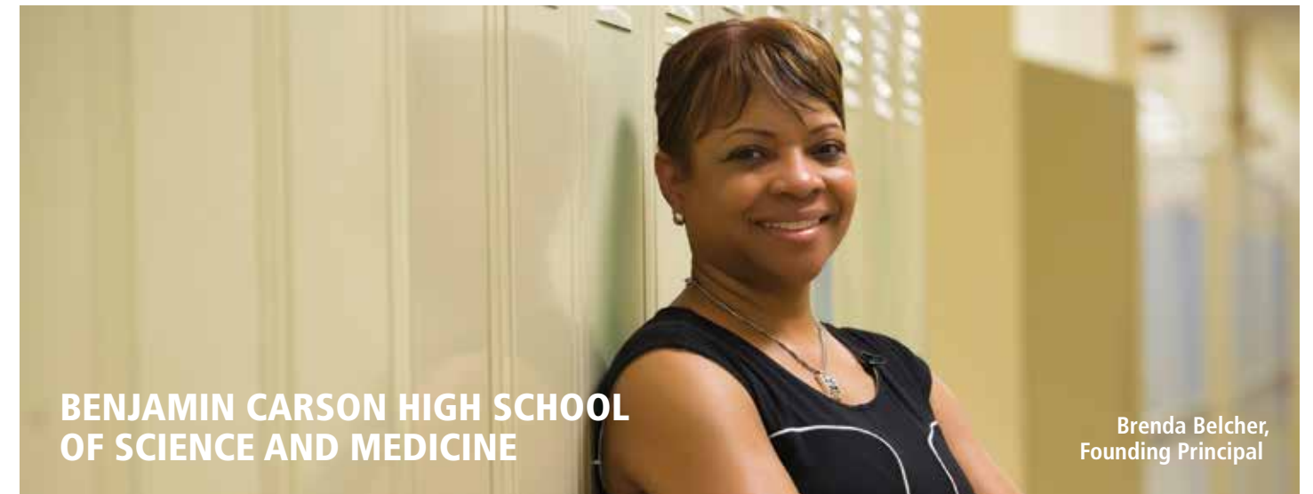
BENJAMIN CARSON HIGH SCHOOL OF SCIENCE AND MEDICINE